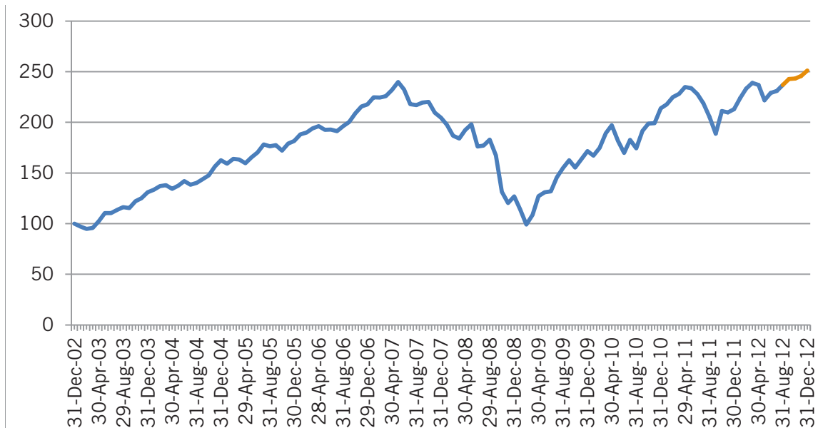
CRSP US MID CAP VALUE INDEX